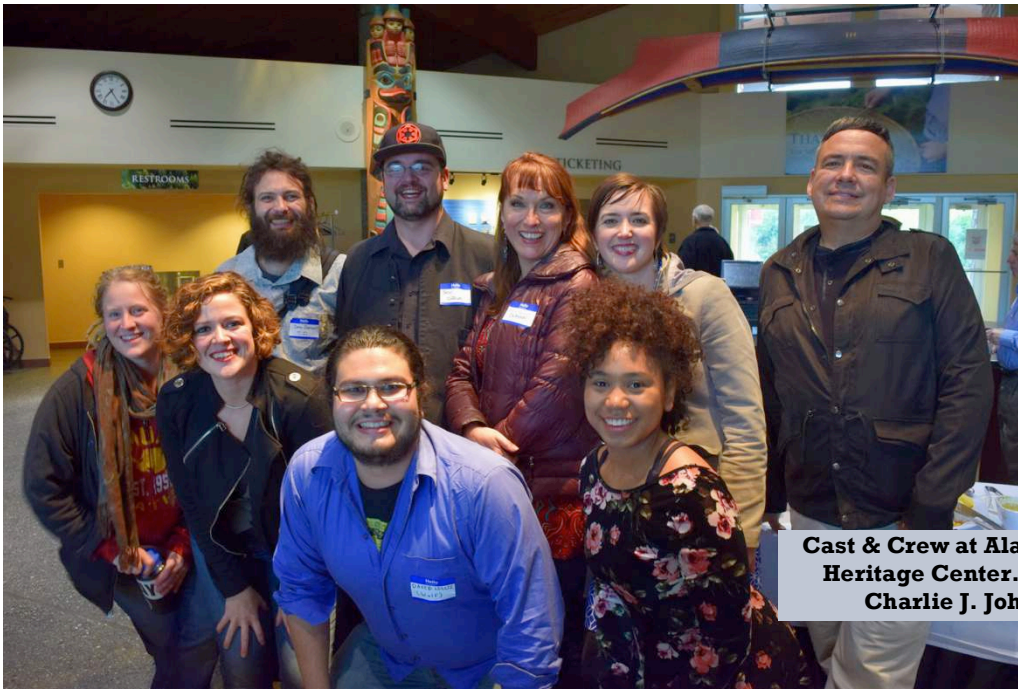
Cast & Crew at Alaska Native Heritage Center.