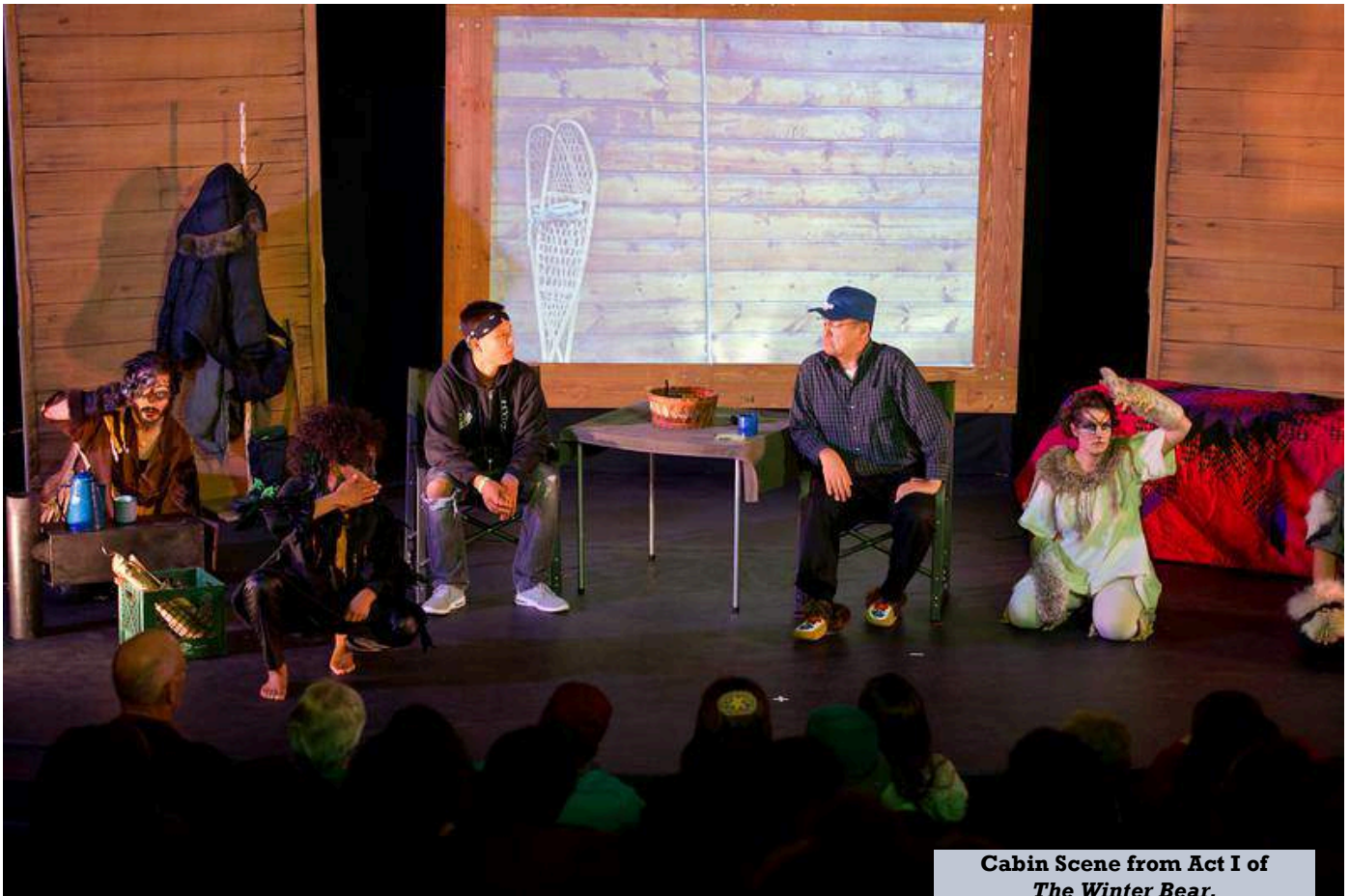
Cabin Scene from Act I of The Winter Bear.