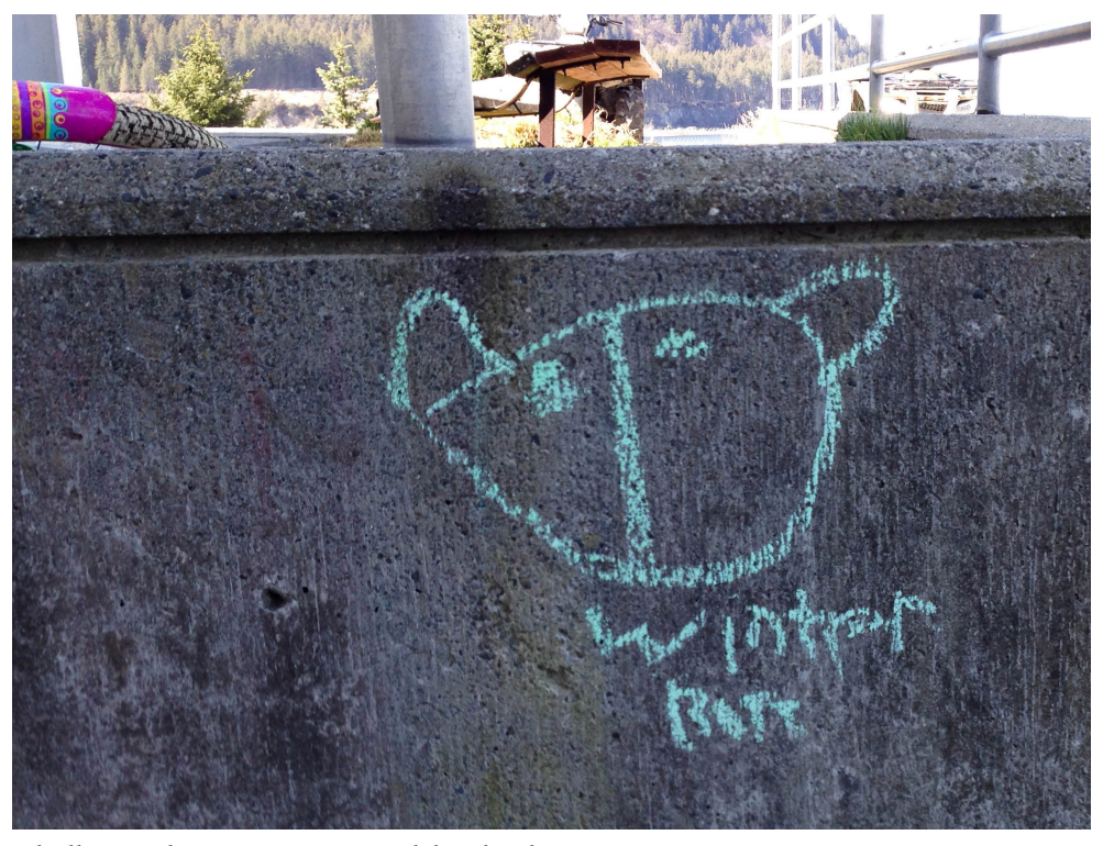
Chalk art advertising at Nanwalek School

Every community we visited was grappling with the aftermath of unexpected death and suicide in its own way. We learned so much from all of them. They have the knowledge, the experience, the expertise, the stories - and the will - not only to cope but also to change the climate of fear and hopelessness that leads to suicide.