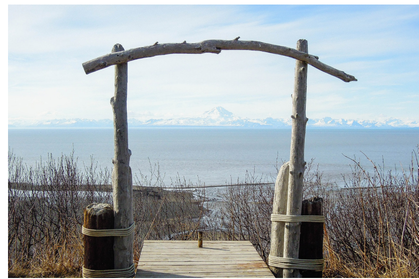
View from Bluff House, Ninilchik

Next stop: Ninilchik where the Ninilchik Traditional Council had arranged housing for us at Bluff House Bed & Breakfast. We had a stimulating afternoon playing theater games with kids at the Teen Center who, after some initial hesitation, proved to be "naturals" at improv. The actors all felt extremely lucky to have a real bed and delicious home-cooked breakfasts both days. We're grateful to the Ninilchik Traditional Council for providing us with this wonderful treat.