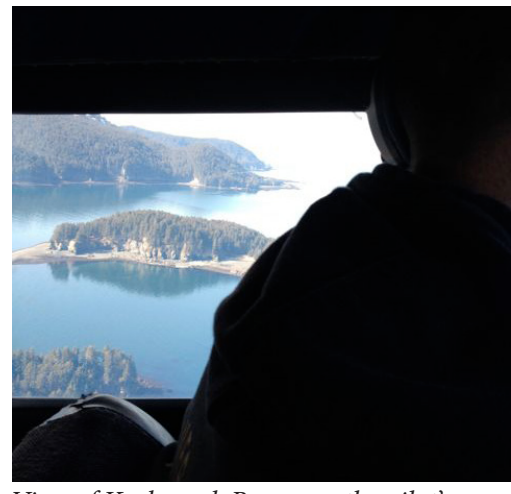
View of Kachemak Bay over the pilot's shoulder

Nanwalek and Port Graham are only five miles apart, but the only way to get over the mountains between them is to take a 15-minute flight. Although short, it was exciting since a huge Spartan 151 Jack-up rig was anchored in Port Graham Bay directly in front of the approach to the runway. Our pilots deftly skirted the rig and deposited us just outside the doors of Saint Herman of Alaska Russian Orthodox Church. We were all grateful to St. Herman and to our pilots for our safe arrival. The set traveled by truck the